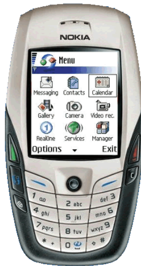
Figure 1. Series 60 user interface

MMS), e-mail, browsing using WAP or others, and so forth.