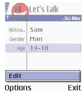
Figure. 2 Profile form

Cobain is an API (application programming interface) that permits the development of Bluetooth applications, simplifying the development process for this kind of application in the Symbian OS (Dahlbom & Kokkola, 2004). It consists of a lightweight ad-hoc networking framework, providing a Unix-like API socket, hiding details of implementation, such as Active Objects handling.